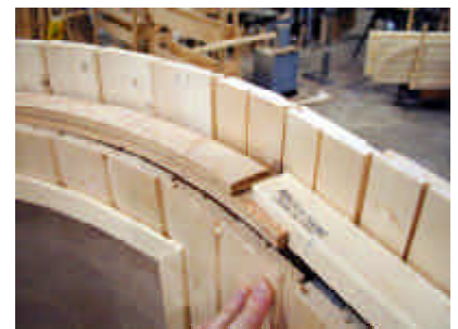
inserting top plate