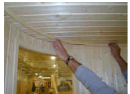
flexing the cove molding