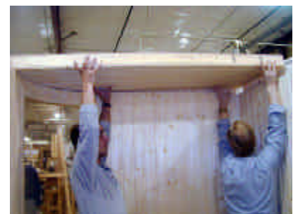
placing ceiling panel into position