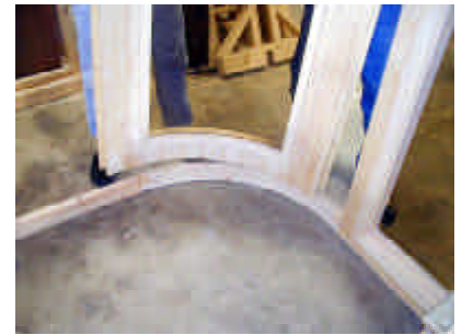
placing panel 1 on base rail