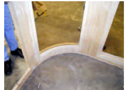
panel 1 positioned on base rail