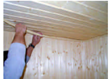
positioning curved cove molding